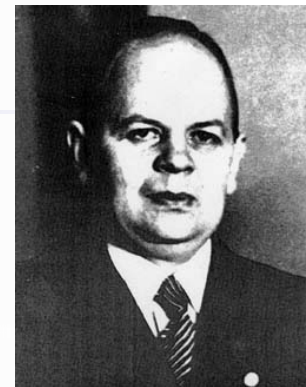
Wilhelm Ackermann 1896-1942