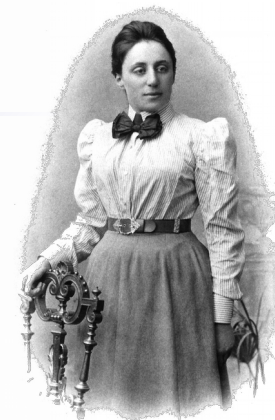
Emmy Noether 1882-1935

As with cumulative induction, the base case is subsumed by the induction step. In practice, it is still often handled separately.